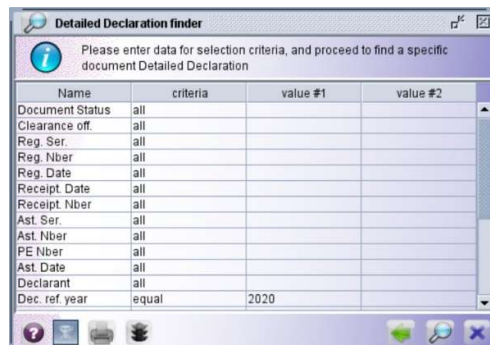
Figure 2: Detailed Declaration finder