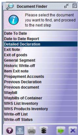
Figure 1: Document Finder window