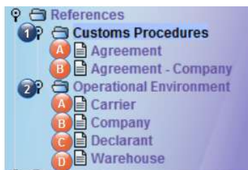
Figure 2: References list