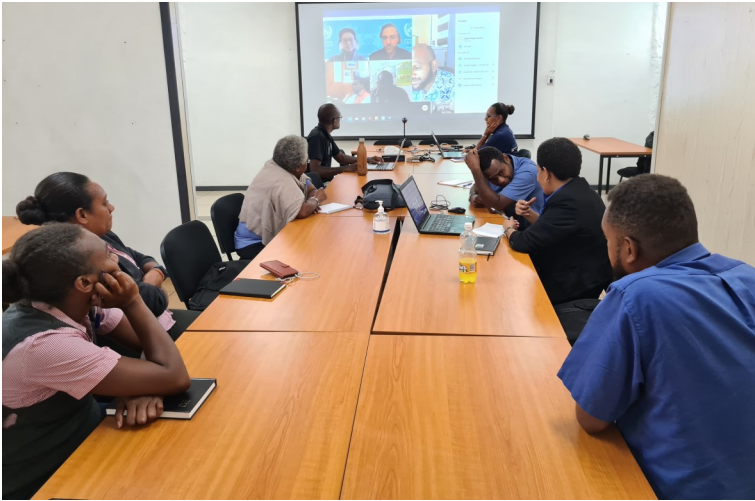
Some of the 20 Vanuatu Contact Points during the virtual training

Despite Vanuatu's outstanding ratification of the PACER Plus Agreement, the country was fortunate to have received funding from the Agreement and technical assistance from United Nations Conference for Trade and Development (UNCTAD) to develop and publish all regulatory and procedural requirements of goods, investment and immigration in Vanuatu, to fulfil the transparency article of the Agreement.