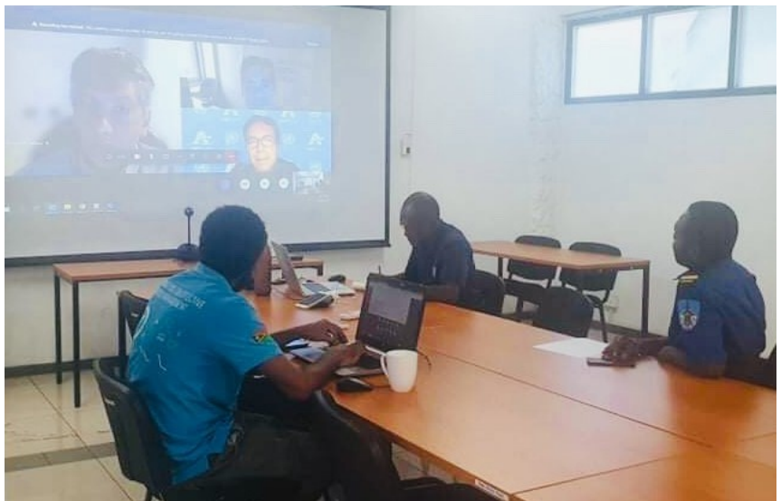
Virtual inception mission with UPU and UNCTAD experts

Following the signing of this Project in May 2021, the VeSW and Customs team have been working with the UPU and UNCTAD team in preparing for the development of this electronic interface between the two systems in Vanuatu.