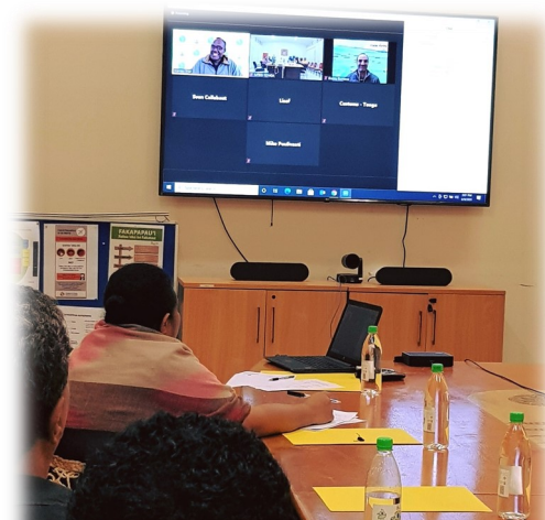
Some of the training participants in Tonga