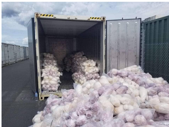
Frozen Vanuatu crops being unpacked in New Zealand

Despite launching the SPS module back in March 2019, the VeSW Project was committed to provide ongoing support to Biosecurity to further enhance the module, assist with any technical issues and provide further development to the module to meet changing SPS requirements. This is part of the mandate of the Project to provide ongoing support to the users of the system to ensure sustainability. This was also possible with the ongoing assistance of UNCTAD experts who are providing online support remotely.