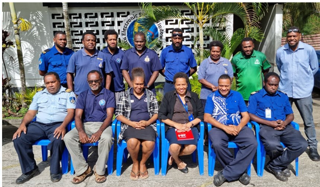
Customs (and Industry) officials during the internal training of the PCO module

Following the deployment of the Preferential Country of Origin (PCO) Module in June, the VeSW and Customs team have been working during the entire month of July to validate the prototype.