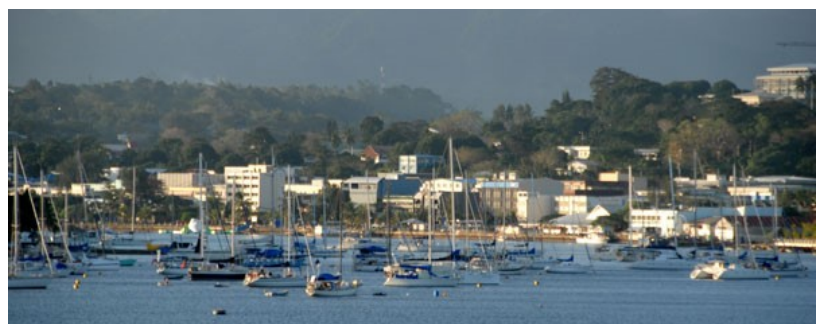
Yachts in Port Vila. Yachts are also processed in the Passenger module.