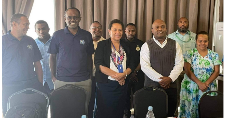
Some of the Officials at the recent Trade Facilitation Steering Committee meeting

The TFSC reports directly to the National Trade Development Committee which is chaired by the Minister responsible for Trade.